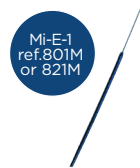
Mi-E-1 ref.801M or 821M

Color of the notes. The blue ring corresponds to the medium tension set.