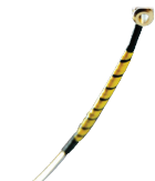
Silk color on the ball side

Color of the notes. The blue ring corresponds to the medium tension set.